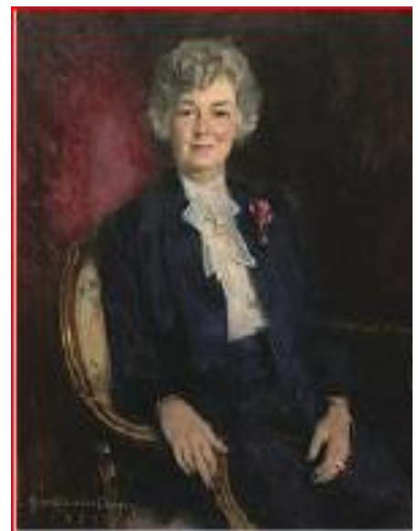
Edith Nourse Rogers