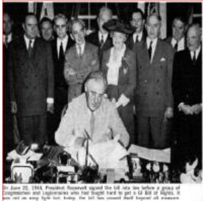
On June 22, 1944, President Roosevelt signed the bill into law before a group of Congressmen and Legislators who had fought hard to get a GI Bill of Rights. It was not an easy fight but today, the bill has passed itself beyond all measure.

At the end of the World War I, Edith Nourse Rogers' husband, John Jacob (Army), joined the American Legion and she joined the Auxiliary. Her experience with veteran's issues led President Warren Harding to appoint her as the inspector of new veterans' hospitals from 1922 to 1923 for $1.00 a year.