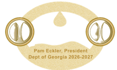
Lapel Pin Department of Georgia 2026-2027